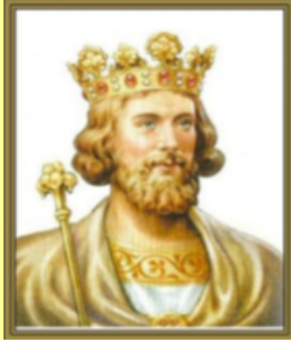
Edward II 1307 - 1327