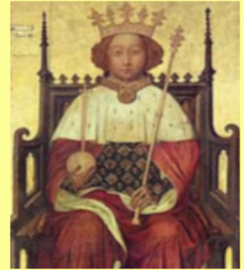
Richard II 1377 - 1399

Who was in power during most of the plague outbreak?