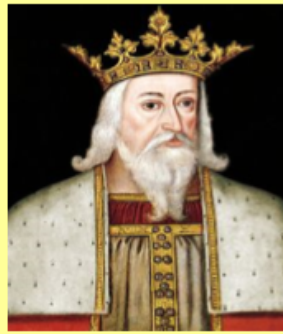
Edward III 1327 - 1377